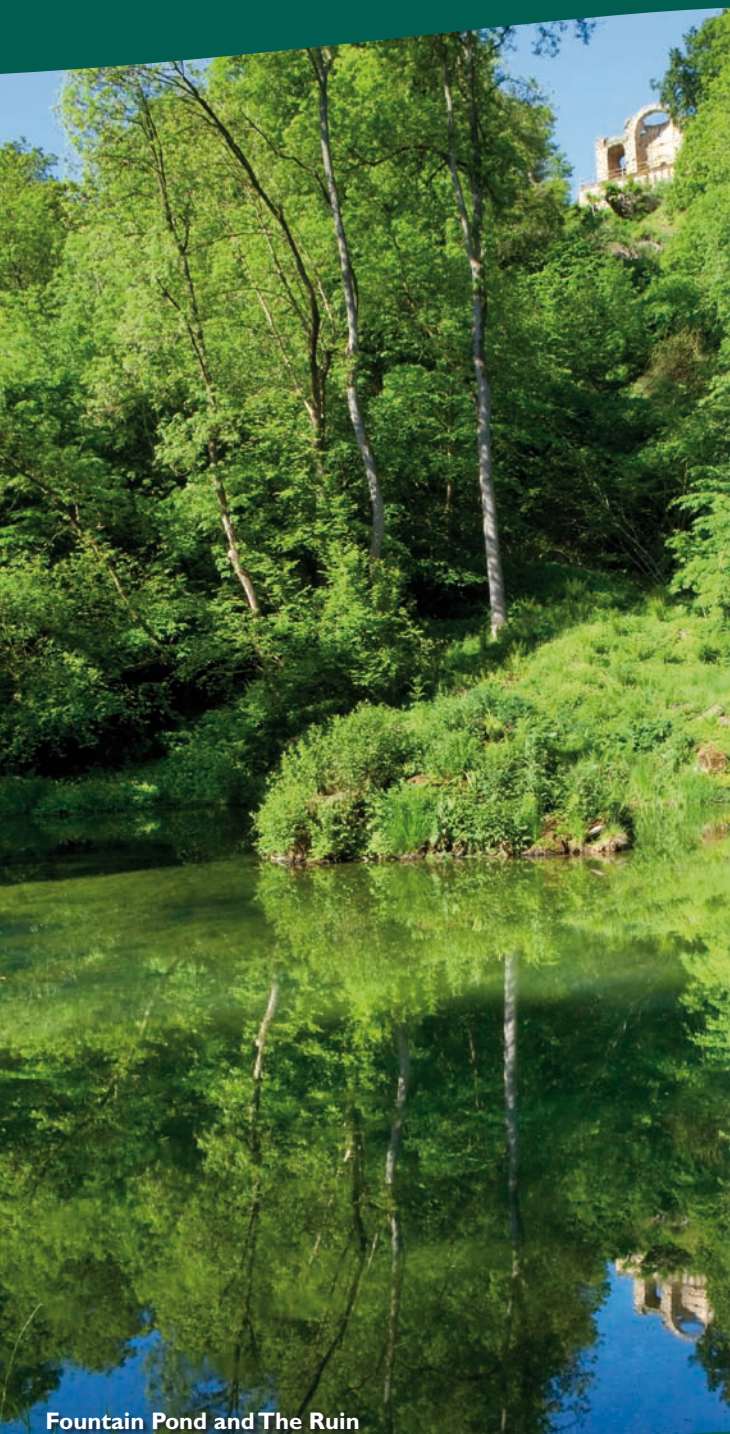
Fountain Pond and The Ruin