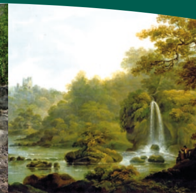
View from Sandbed, Devis c.1770

From Alum Spring return to the main path above Kent's Seat and continue left uphill. At the next junction turn sharp right and follow the path to the viewpoint at The Ruin (please respect the privacy of any guests staying at The Ruin and use the path at the edge of the field to the west if you visit before 11am or after 3pm). Continue on the woodland path to the top of Limehouse Field and back to the car park.