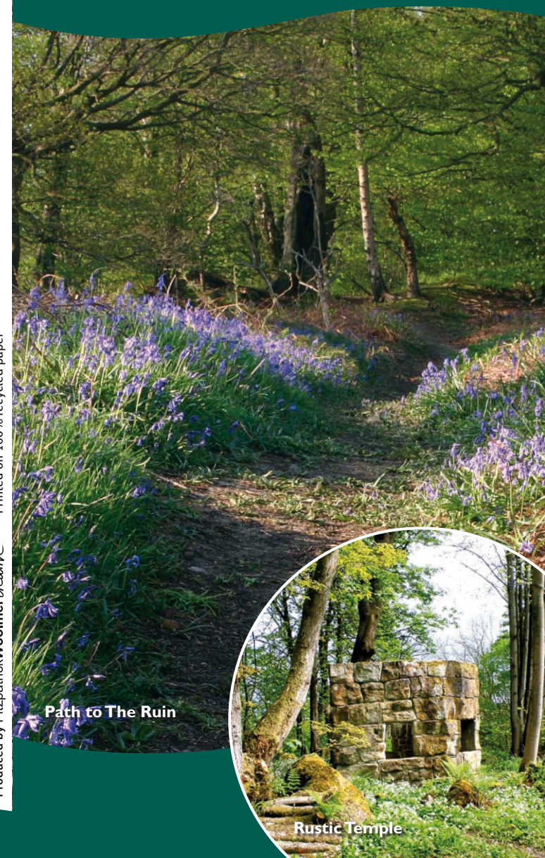
Path to The Ruin

Printed on 100% recycled paper Produced by Fitzpatrick Woolmer Creative